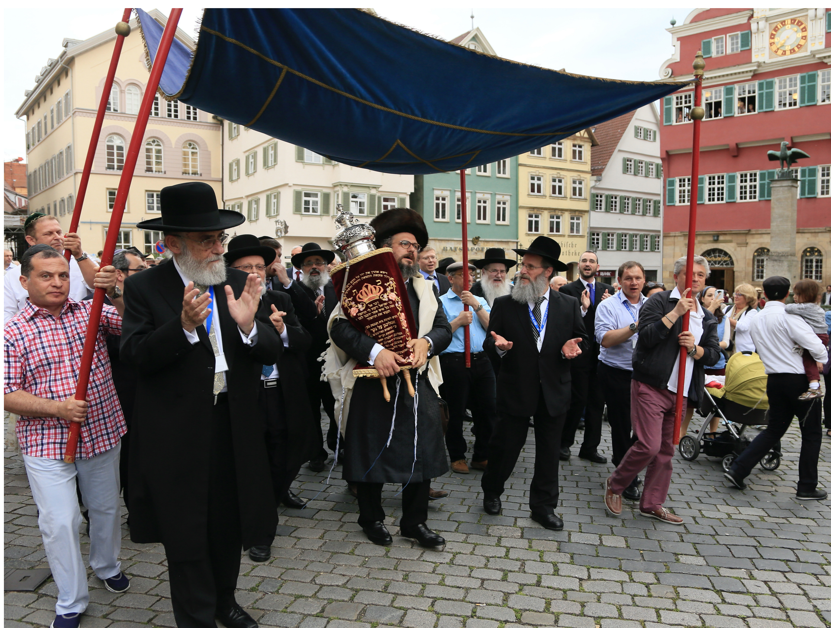
The new Torah scroll is escorted to the synagogue on June 7, 2016

“Today the burned letters of the Torah scroll have been returned and reassembled.”